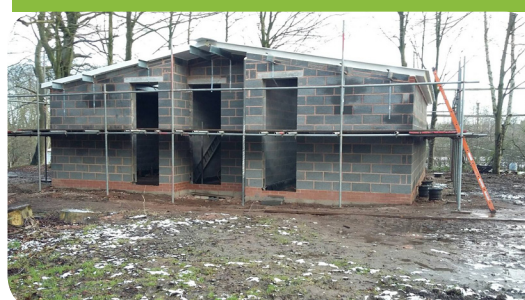
Day Block under construction

This new building has been funded partly by ourselves, and partly through the generosity of various Charitable Trust Funds. Our special thanks go to the The Connie & Albert Taylor Charitable Trust, GJW Turner Trust, The 29th May 1961 Charitable Trust, The Lopylugs & Barbara Morrison Charitable Trust, The Eveson Charitable Trust, The Goodenough Charitable Trust, The Saintbury Trust and an anonymous donor. We are extremely grateful to you all because, without your support, our new Day Block would not have been built.